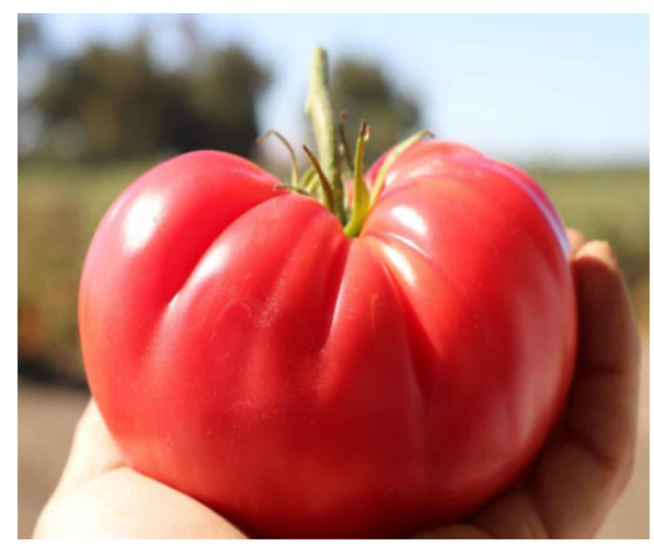
Pink Delicious Tomato

This early maturing tomato comes with an heirloom look and good flavor and texture mixed with hybrid disease resistance. The uniform fruit size also resists cracking. A pink tomato shines for its flavor and its disease resistance, especially in the southeast regions.