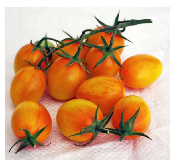
Sunset Torch Tomato

This hybrid performed well in containers and landscapes. The number of flowers was impressive with non-fading petals contrasting with sky blue and yellow centers. The compact habit plants produced well in warmer climates and in strong sunlight for a long time period.