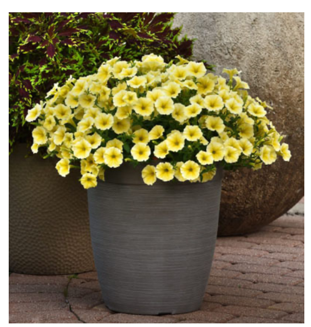
Bee's Knees Petunia

This hot pepper produces a good yield of juicy thick-walled green to red fruits on strong upright plants. The fruits are attractive enough to be used as an ornamental, with slightly larger fruits and are faster to mature than others, with slightly less heat.