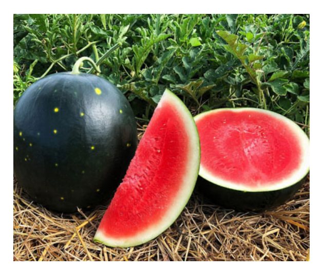
Century Star Watermelon

This early maturing tomato comes with an heirloom look and good flavor and texture mixed with hybrid disease resistance. The uniform fruit size also resists cracking. A pink tomato shines for its flavor and its disease resistance, especially in the southeast regions.