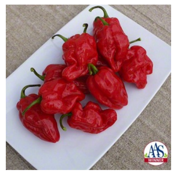
Pepper Habanero Roulette