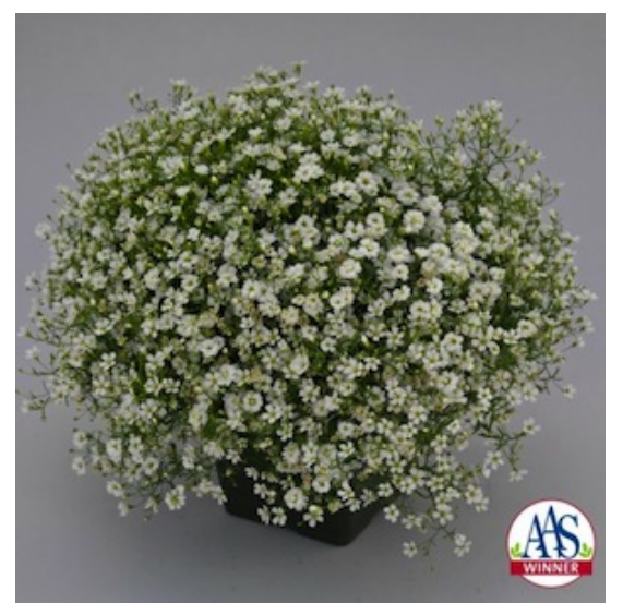
Gypsophila Gypsy White Improved