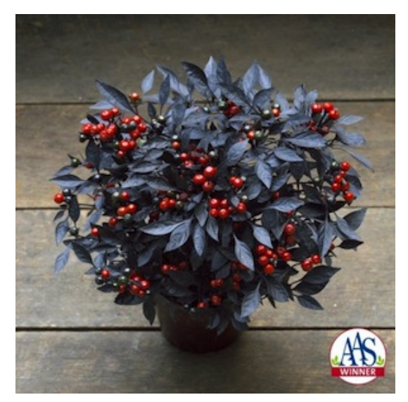
Ornamental Pepper Onyx Red