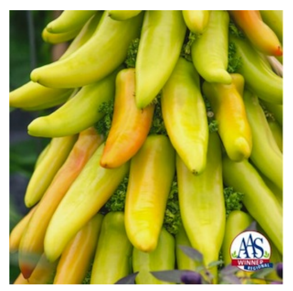
Pepper Hungarian Mexican Sunrise