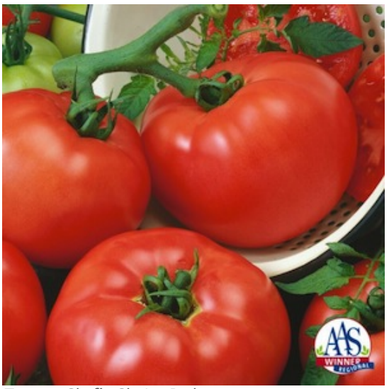
Tomato Chef's Choice Red