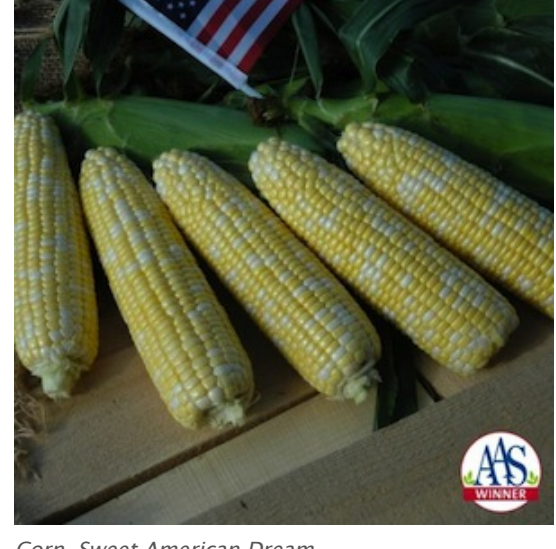
Corn, Sweet American Dream