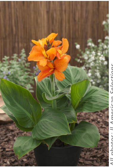
Canna South Pacific Orange