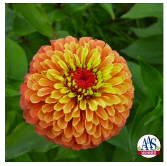
Zinnia Queeny Lime Orange