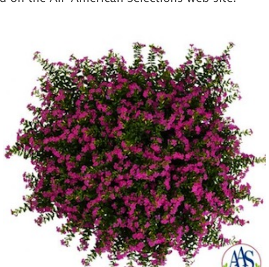
Cuphea FloriGlory Diana