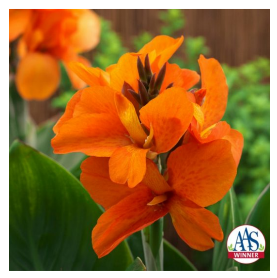
Cana South Pacific Orange F1

Past year winners and Gold Medal winners can be found on the All-American Selections web site.