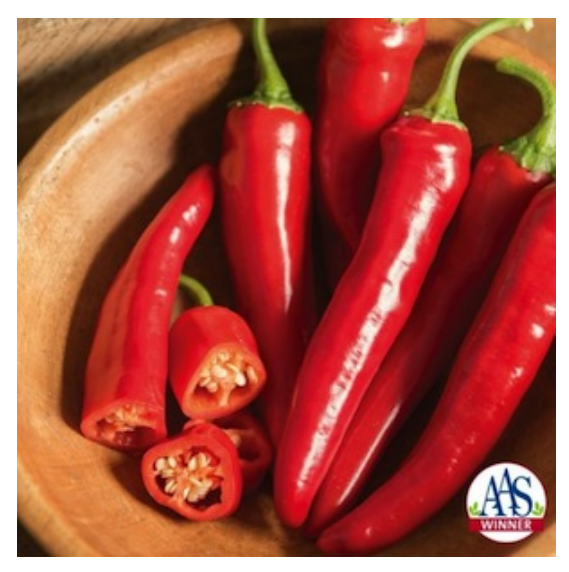
Pepper Cayenne Red Ember