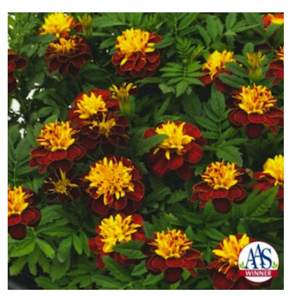
Marigold Super Hero Spry