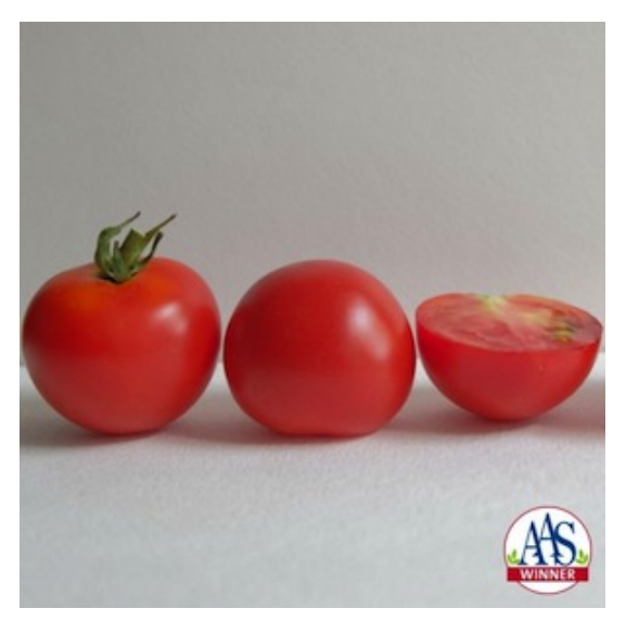
Tomato, cocktail Red Racer